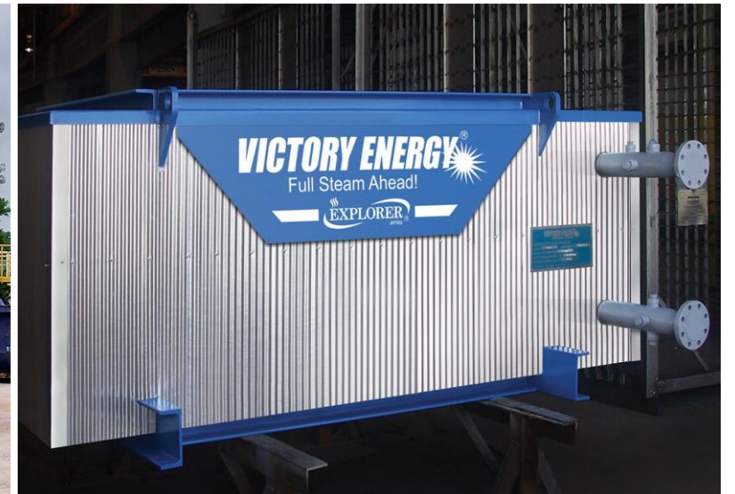
EXPLORER series Economizer Heat Recovery Unit