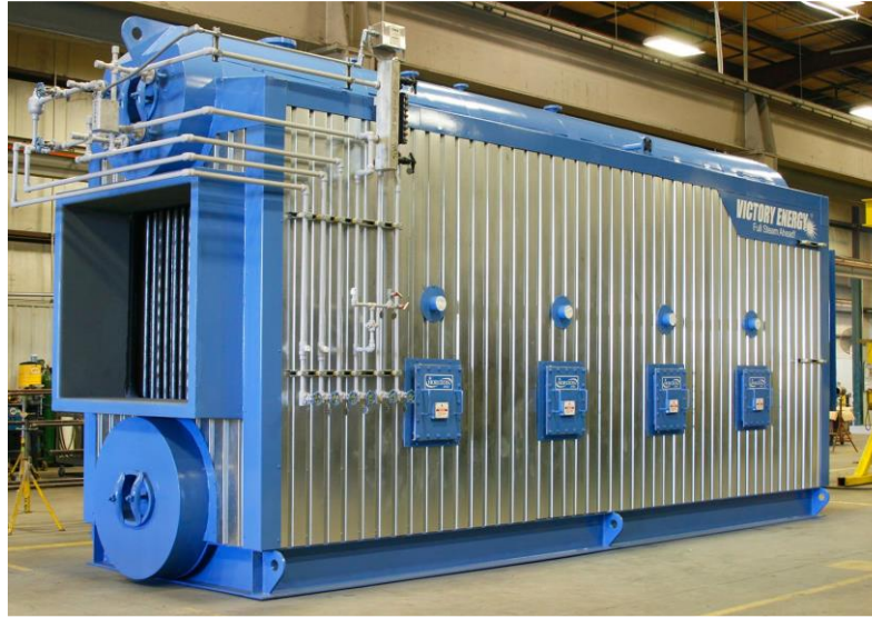
HORIZON series WHB Waternube Boiler