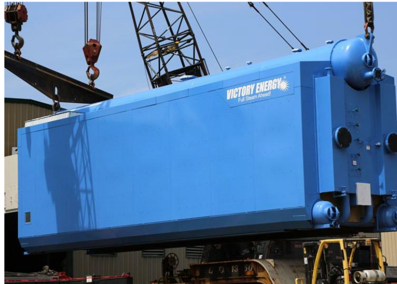
VOYAGER series A-Type Watertube Boiler