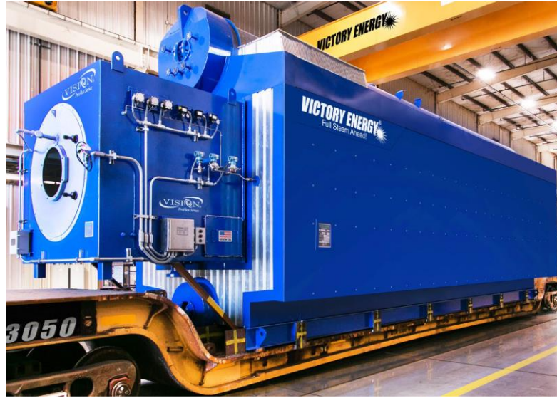
VOYAGER series O-Type Watertube Boiler