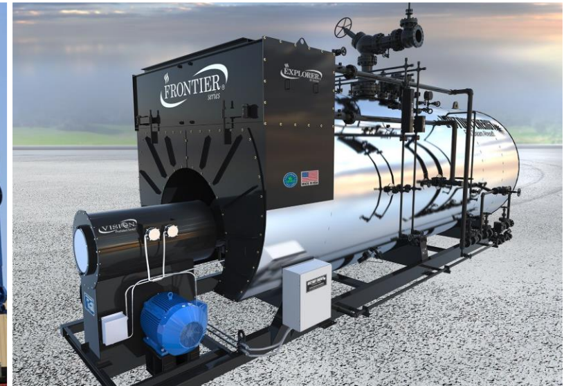
FRONTIER series Firetube Boiler