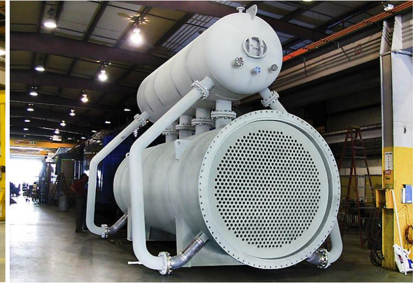
HORIZON series WHB Firetube Boiler