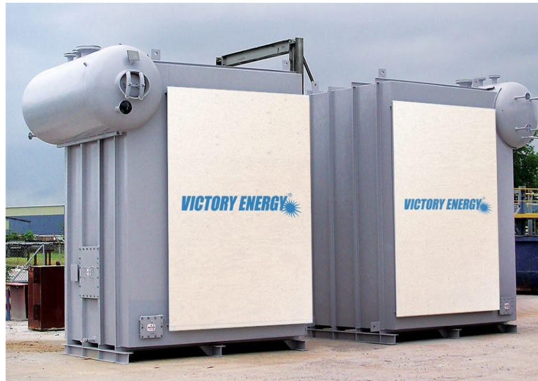
HORIZON series HRSG Heat Recovery Steam Generator