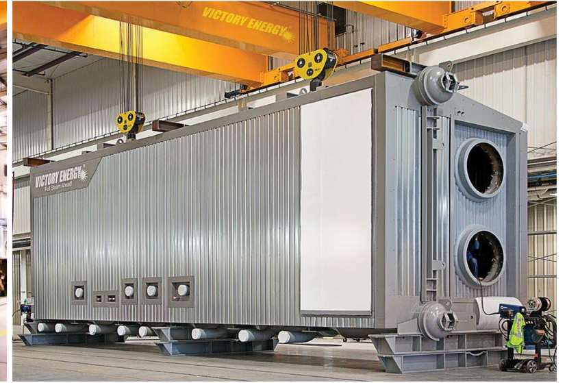
DISCOVERY series D-Type Watertube Boiler