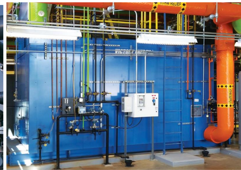
GENESIS series HTHW High Temp Hot Water Generator